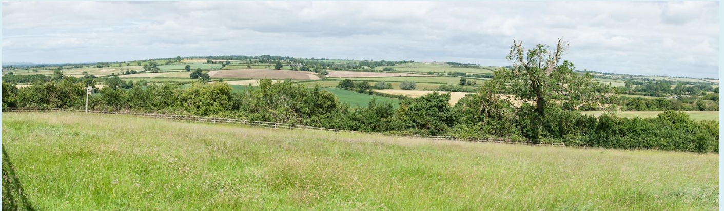
A BORG nest box amid a view of ideal foraging habitat for owls and kestrels in Aston Abbots

We look forward to continuing our journey of Barn Owl and Raptor conservation across Buckinghamshire.